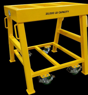
Shown without tool shelf