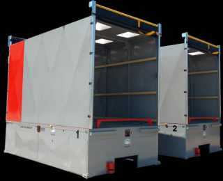
Titan 173777 Unmanned Transporters