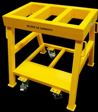
20,000 lb capacity (per stand) work stands with optional tool shelf on bottom