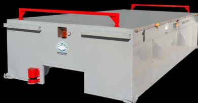
Titan 173777 without Deck Enclosure