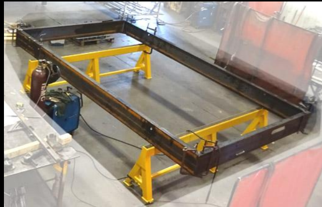
Extended length (10') work horses on site

To see all our Die or Mold Handling Solutions