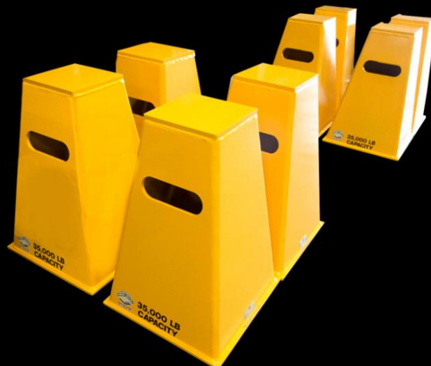
35,000 lb capacity (per stand) work stands