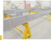
At industrial site