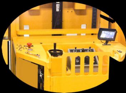
TV Monitor on Operator station