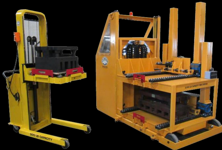
The Mini-Titan next to a custom full sized Titan over/under cart

The Mini-Titan , the new standard die cart line, offers a 250 to 2,000 lb. capacity range and will demonstrate the same great quality and longevity and many of the great features that built the Titan name. The Mini-Titan series is much safer and faster than using a forklift or manual pump cart and is designed with a variable height deck (or decks) with manual cart mobility via ergonomic push handle. The transfer deck options include single or dual over & under decks, ball rollers, inline roller, steel, and low friction UHMW surface. The standard design allows Green Valley to respond to its customers' die handling needs with minimal lead times.