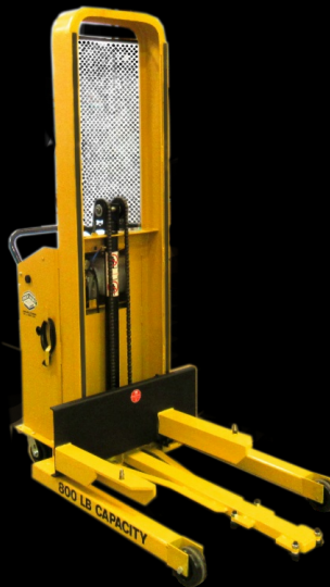
Custom Fixture/Die Cart

This TITAN 163559 was designed with custom forks to transfer dies in and out of the press and to the storage location. Floor mounted docking rail brackets guide cart to precise transfer location. It is a manual transport system via an ergonomic push handle and an hydraulic mast lift, with an operator screen for safety.