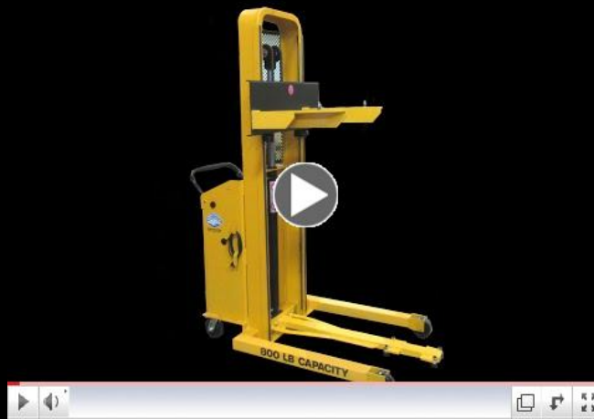
Titan 163559 Manual Custom Fixture/Die Cart

Our highly competent team of engineers and technicians can design and manufacture tool handling systems for a wide variety of customers' needs, capacities, configurations, and environments.