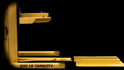
Custom forks and docking rail